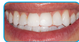
After applying Enamelast